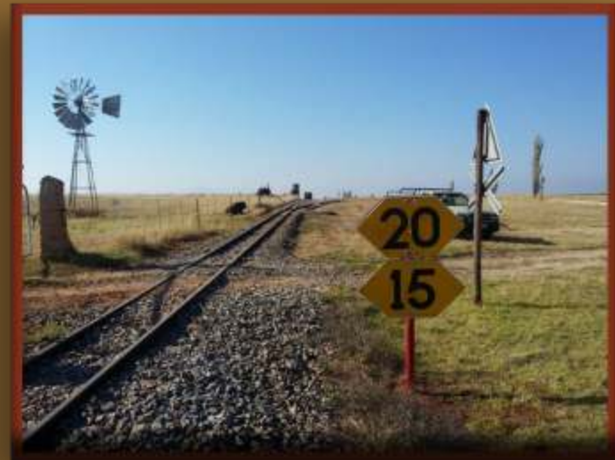
Below: Images of the west side of the new loop line through Mooihoek.