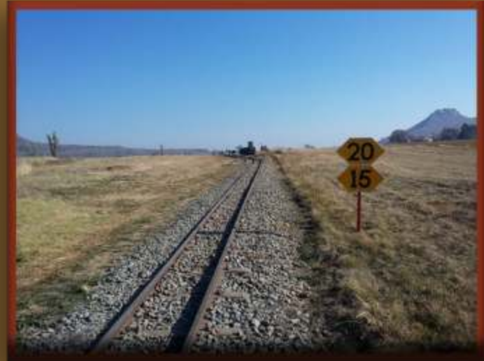
Below right: The speed post from the west side