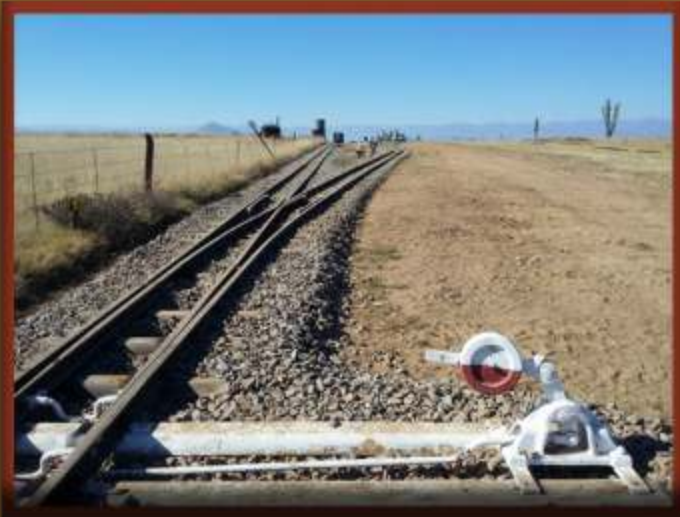
Below left: The new line neatly boxed.

Two speed post signboards were fitted 30M from each side of the siding indicating the maximum speed through the siding, the top one for the mainline and the speed post below showing the speed for taking the loop line.