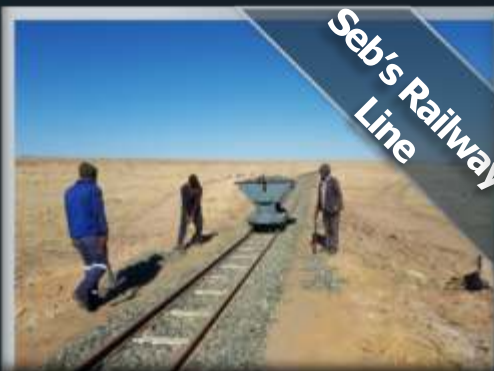
Seb's Railway Line