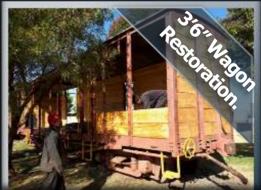
3'6" Wagon Restoration.