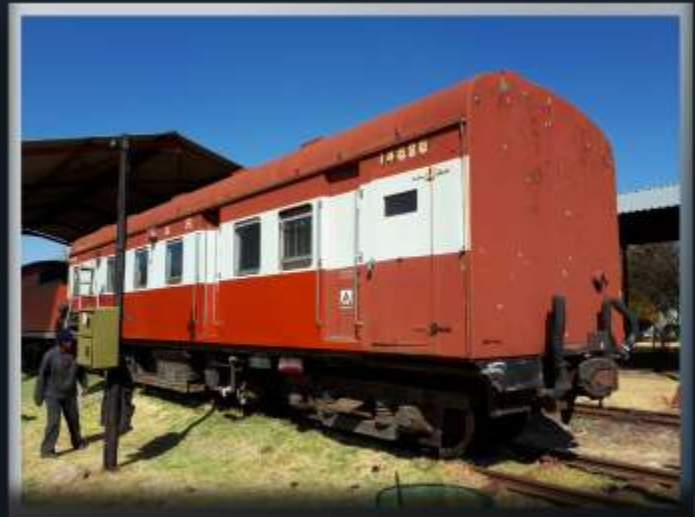
He now only needs to paint the under frame in black livery to complete this cosmetic restoration.