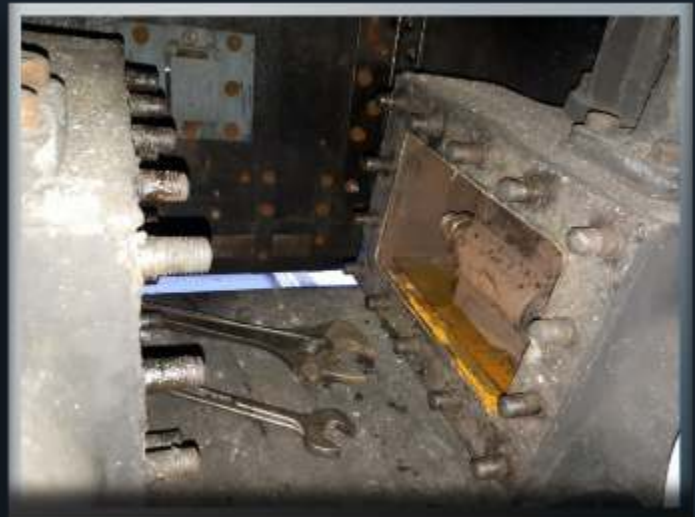
Last week we shunted the Peckett to the inspection pit for under frame inspection as well as for valve setting. the valves were set and we tested her last Friday.