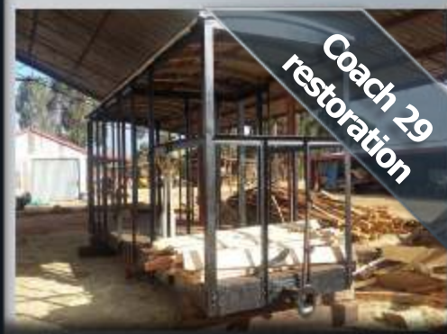
Coach 29 restoration