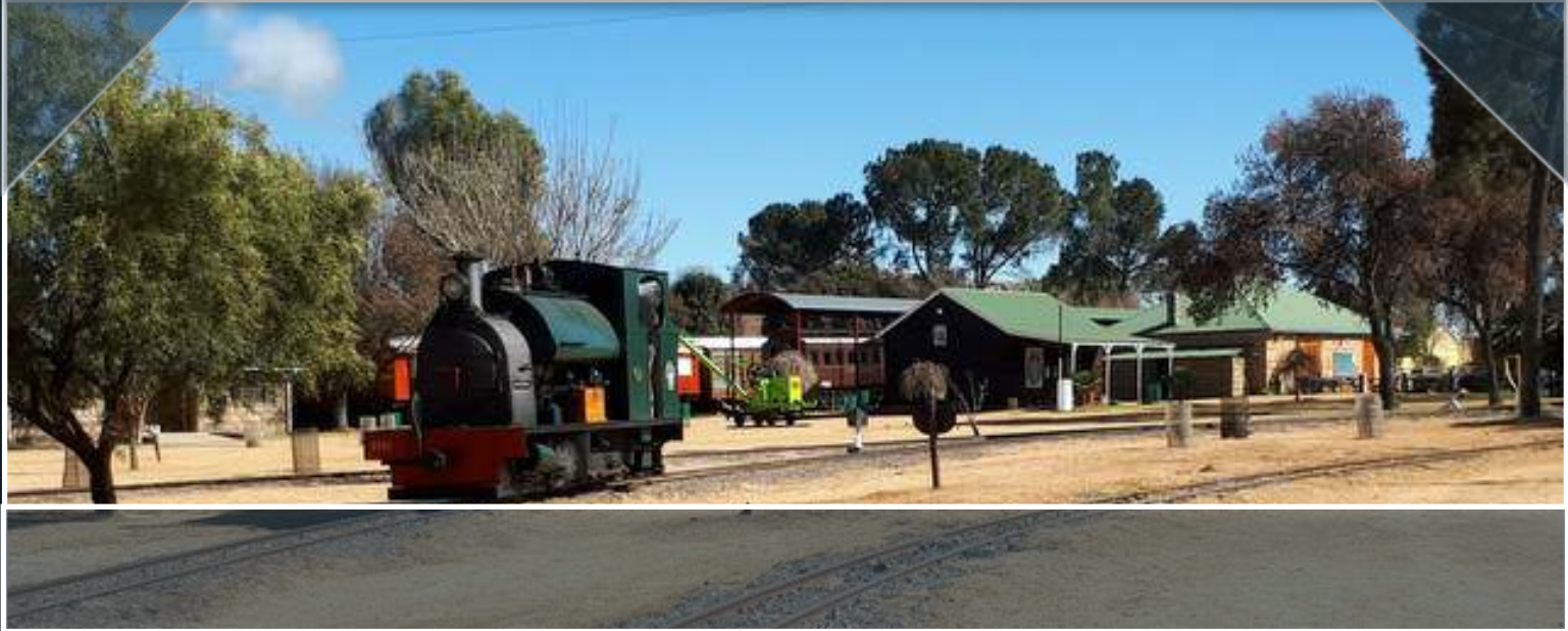
This week we have steamed up our very special little locomotive for a short passenger train to Grootdraai. The RSG 4 x 4 club visits Sandstone Estates every year and this year was no different.