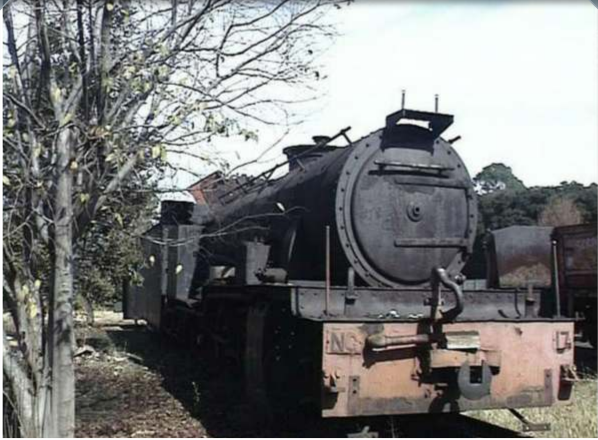
NG 15 Number 17

Here is a picture of NG15 No 17 at Springs in March 2002 being uplifted to Bloemfontein. It entered service in July 2003.