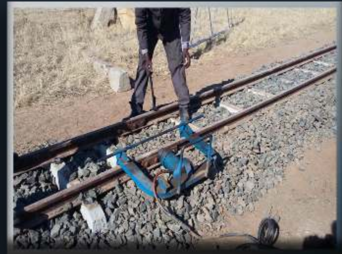
Above right: Slight adjustment to the joint was needed here.