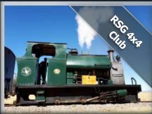
RSG 4x4 Club