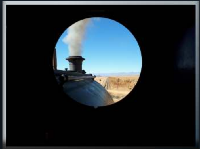
We departed at 11H00 Monday morning on a short trip to Grootdraai where we spent some time viewing The majestic Maluti Mountains.