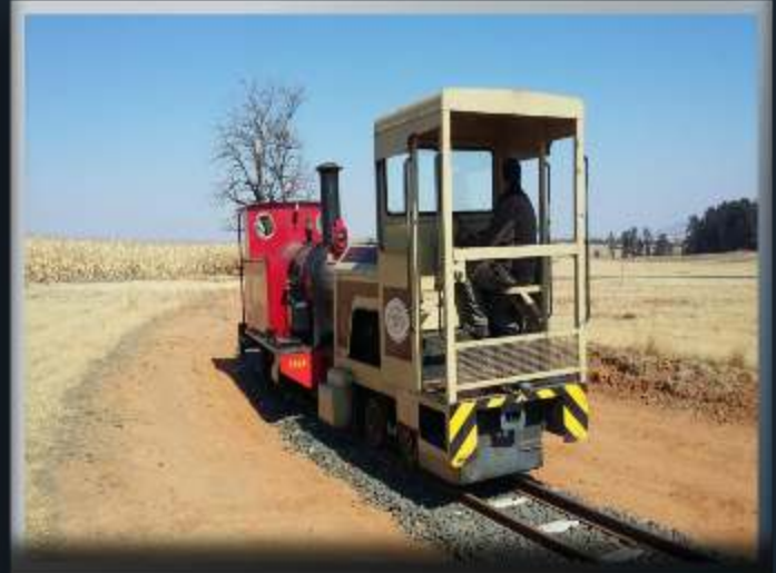
Below left: One of the little Bess coaches being tested around the tightest curves.