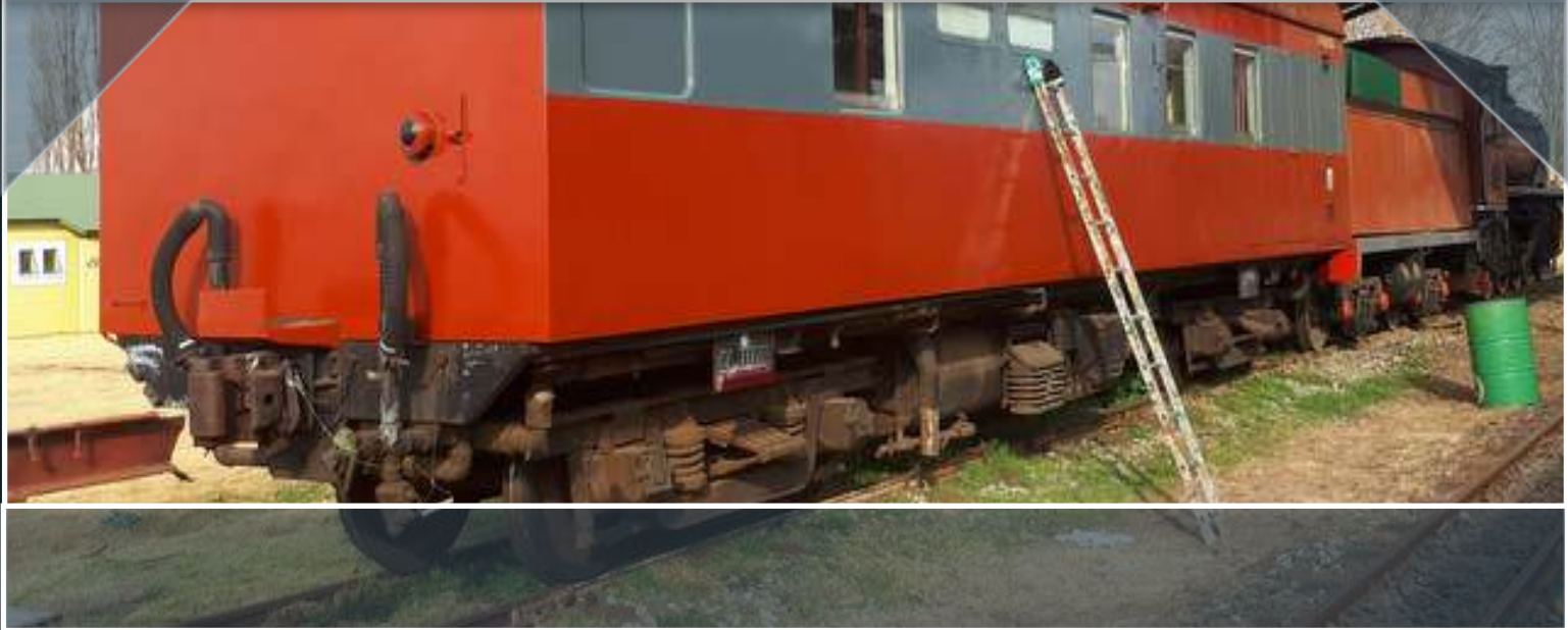
Brian tackled the cosmetic restoration of the 3'6" caboose in Hoekfontein Station.