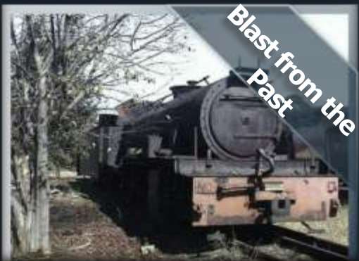
Blast from the Past