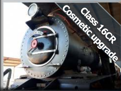
Class 16CR Cosmetic upgrade