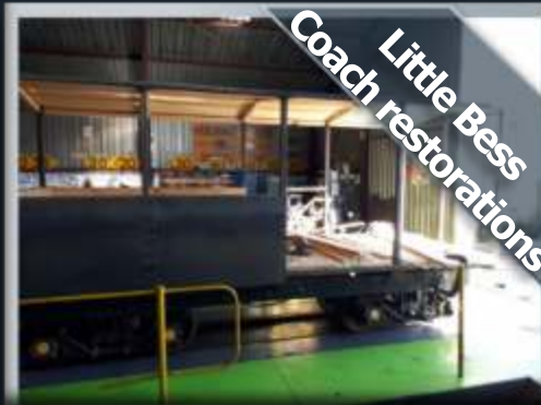
Little Bess Coach restorations