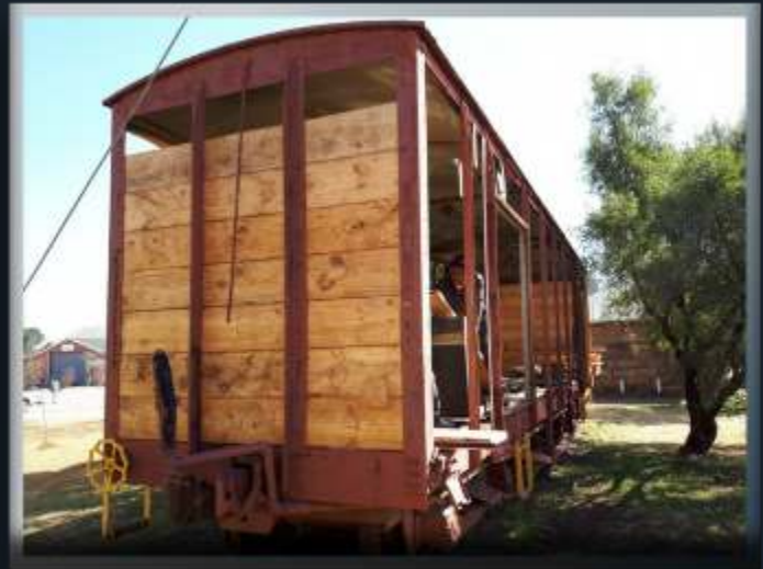
Below: More images of the restoration.