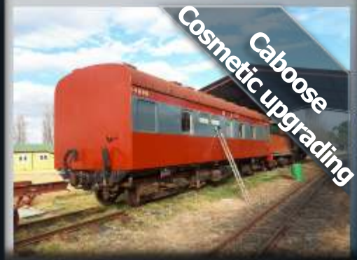
Caboose Cosmetic upgrading